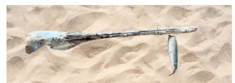
Pelican skeleton with fishing tackle around its beak.