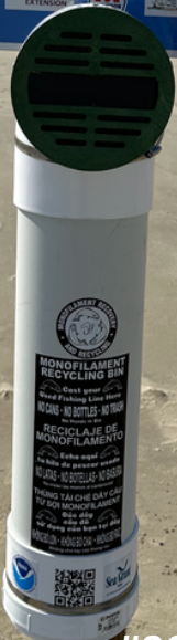
Beach access #36 in Galveston

We can't gather all of the fishing line lost in the Gulf and Bays due to a snags but, there are plenty of tasks we can do to greatly reduce the amount of these wildlife deathtraps. It is our duty to do as much as we can to collect our own fishing line and clean up what is already out there.